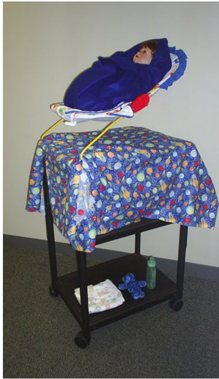
Figure 1 Infant (doll) on out-of-reach cart.

back in a few minutes.” The infant began vocalizing as the experimenter closed the playroom door behind her.